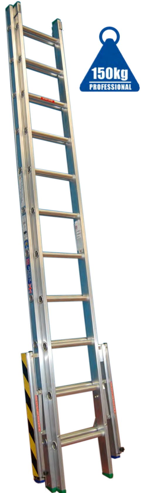
Clow Dual* Section Extension Ladder to EN131:Professional

Deep 'D' shaped rungs for comfort and large angled PVC block safety feet, supported by the heavy duty folding stabilisers make this a strong and robust ladder suitable for use within a wide range of industrial environments.