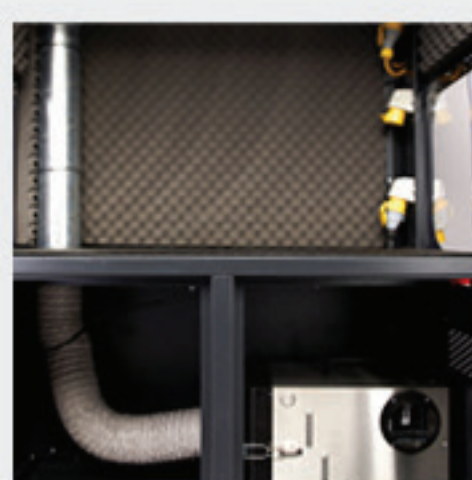
Optional extra of air filtration or dust extraction system