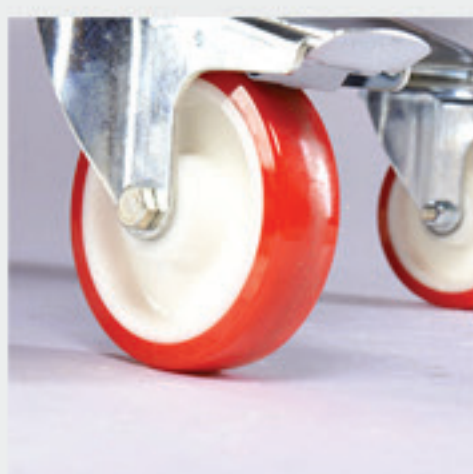
Heavy-duty swivel wheels