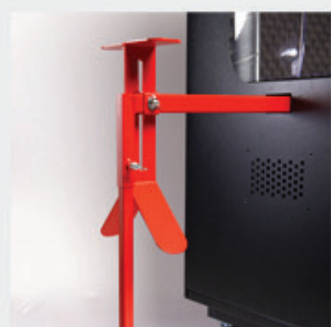
Adjustable extending support arms