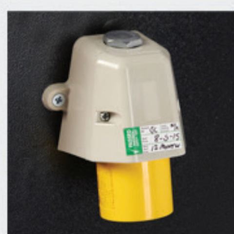
Side 110v inlet sockets

Top = 1200 x 800 x 850 / Bottom = 1200 x 770 x 765