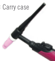
INTEGRATED TORCH CONTROL * On/Off, amperage