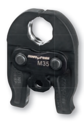
Press jaw PB1