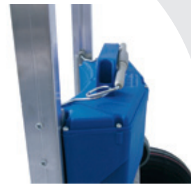
Battery pack retention arm Keeps the battery in place on bumpy ground. Part No. 930 140