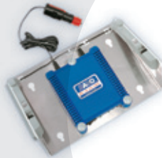
Battery holder with charger unit For charging a replacement battery in a vehicle. Part No. 930 114