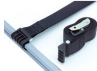
Safety belt – 3.50 m With special hook for safely securing load and heavy-duty metal buckle. Part No. 903 123