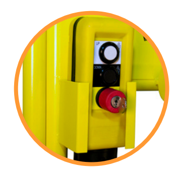
with emergency stop