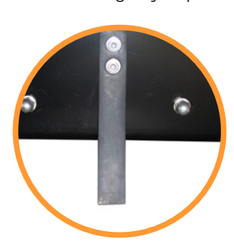
Anti-static earthing strip