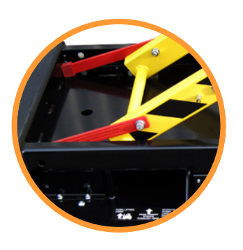
Fail-safe props for deployment during maintenance