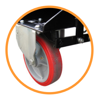
Auto braking on fixed castors