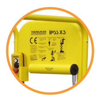
Safety and usage intructions mounted on guardrail