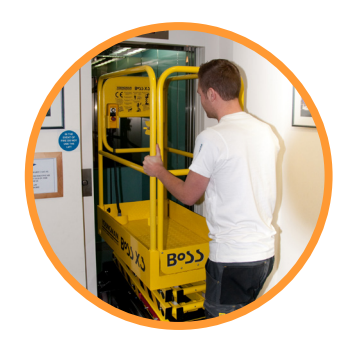
Fits through standard doorways and into passengers lifts