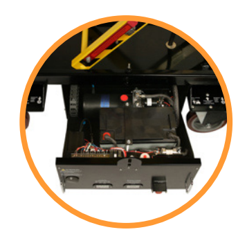
Servicable components housed in a slide out compartment