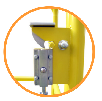
Self closing gate with locking latch and transit gate lock