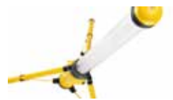
110V - 16A