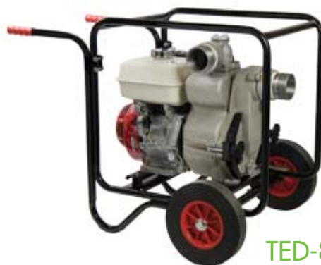
TED-80HA with trolley