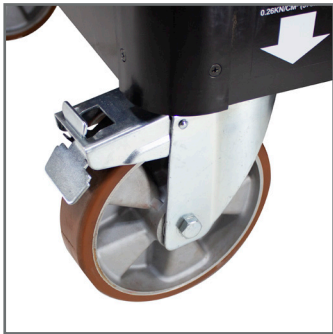
Easy to manoeuvre via heavy-duty castors with non-marking tyres

hospitals, schools, airports, shopping centres, retail outlets, transport environments, factories, offices and on construction sites.