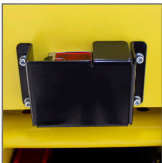
Overhead obstruction detection with alarm frequency increase and interlock