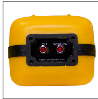
Tilt and overload warning lights, alarm, and interlocks