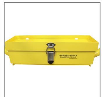
Toolbox containing charging cables and guardrail tools with tray mounted on guardrail