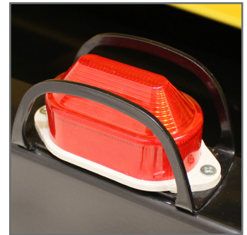
Warning lights and alarm on ascent/descent