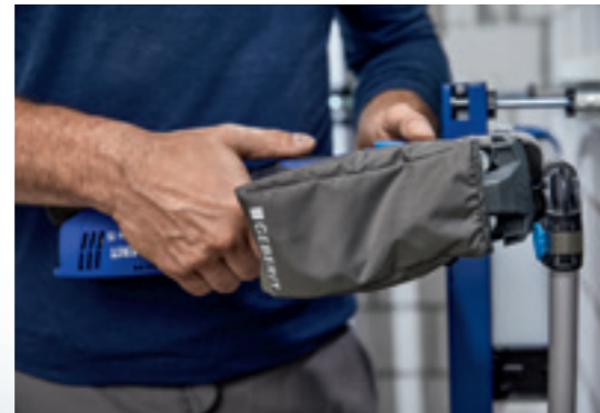
When pressing with the collection bag, the pressing indicators are collected directly and can be disposed of in bulk in the collection container.

Free returns of the pressing indicators and protective caps. These are reprocessed and used in other productions.