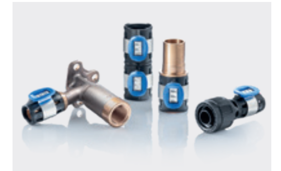
The product range includes a whole host of both standard and special fittings.