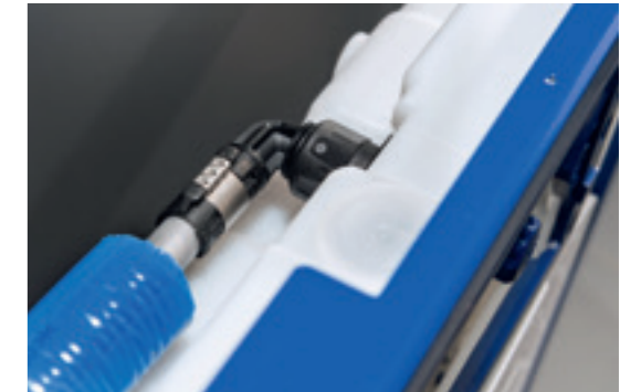
A universal adaptor is available with Masterfix for tool-free connection to Geberit fittings. This eliminates the need for any additional sealing material such as hemp.